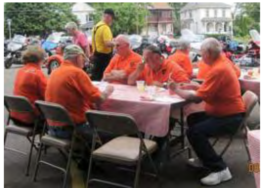
Chapter R Surprise Run Photos More photos on the H-2 website: http://www.ilh2.org/photos/index.html